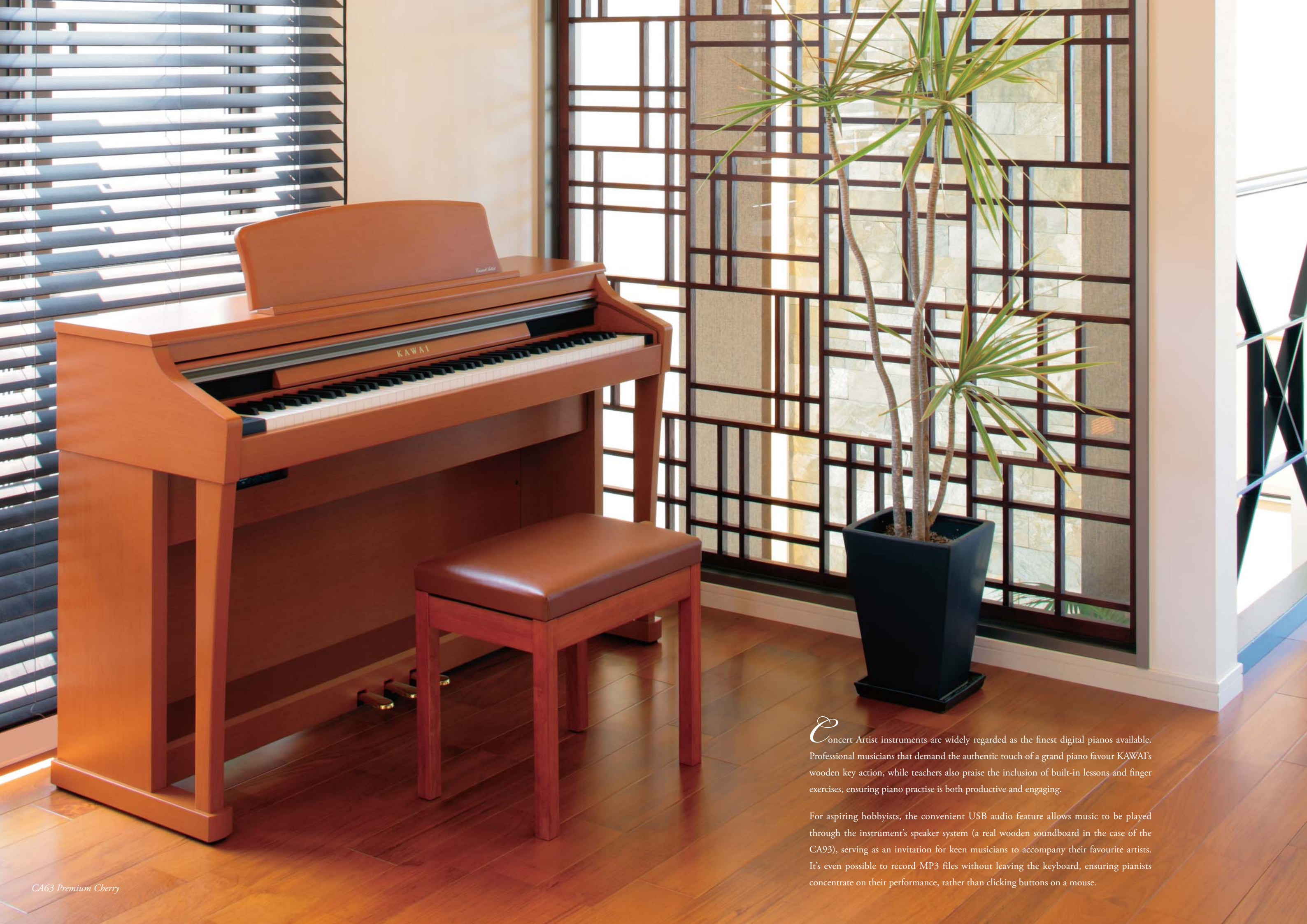
CA63 Premium Cherry

Concert Artist instruments are widely regarded as the finest digital pianos available. Professional musicians that demand the authentic touch of a grand piano favour KAWAI's wooden key action, while teachers also praise the inclusion of built-in lessons and finger exercises, ensuring piano practise is both productive and engaging.